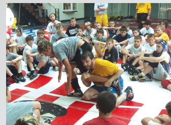
Small Group, Personalized Instruction

4 day camp option for wrestlers with varying degrees of skill, experience, and attention span.